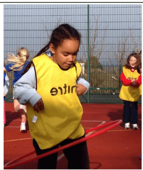
Urdd - Gweithgareddau