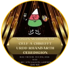
Poster llawn ar waelod y llythyr